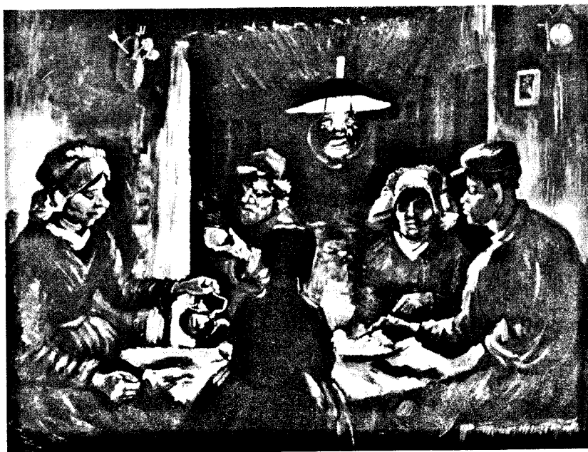
Figure 1 The Potato Eaters by Van Gogh. The original is on the top