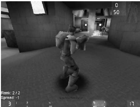
Fig. 1. Unreal Tournament and the Gamebots environment.

and 20% of the total processing time [2]; therefore it is important for the behaviour system to be light in terms of computation time.