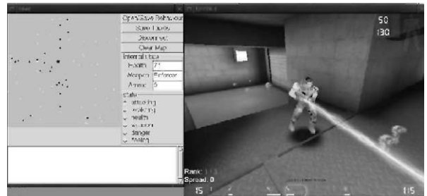
Fig. 3. Interface used to teach the bot: on the right is the normal Unreal Tournament window showing our bot; on the left is our interface to control the bot.

While the previous method of teaching a behaviour works, it deprives the player of the interface he is used to; his perceptions and motor capabilities are mostly