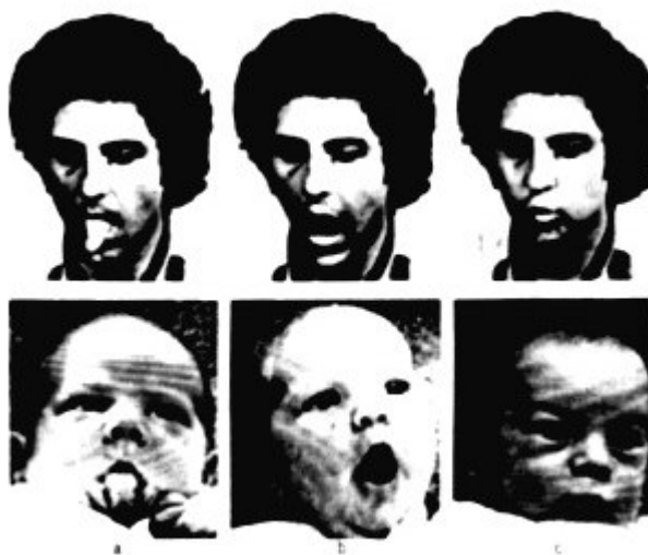
from Meltzoff and Moore 94, 95

We now have arrived at a set of speech sounds forming a word which matches the object, a word which is appropriate for the object to which it refers. How does an infant acquire the word for a visual object on hearing it? From the motor theory of speech perception, the hearing of a word by an adult is perceived in terms of the motor program required to produce the word; the word is cross-modally transformed into the articulatory motor program for producing the word. Similarly for the infant the word is cross-modally transformed (from auditory to motor). There are well-known examples of cross-modal transformation by infants, notably the transformation which must take place when an infant reproduces in its own face the facial expression of the experimenter. See the familiar illustration of a very young child doing this: