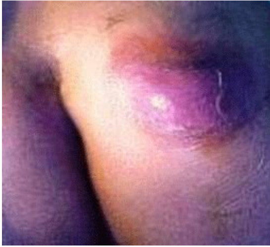
Fig 2: Multiple gluteal abscesses after dermal filling

flammation or even abscesses may be due to common skin and soft tissue pathogens, including Staphylococcus aureus . 3