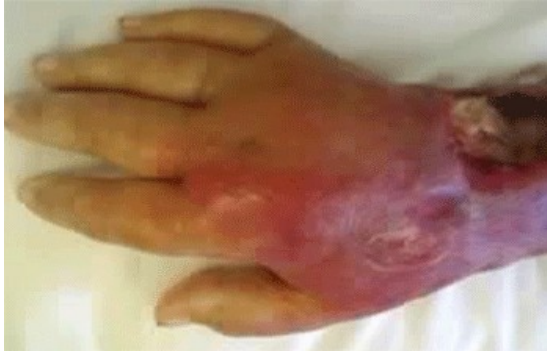
Fig 5: Skin necrosis over dorsum of hand after dermal filling