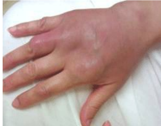
Fig 3: Multiple nodules over dorsum of hand one year after dermal filling with silicone.

such as the lip, or with the use of poly-L-lactic acid, particularly because of the inadequate dilution of filler.