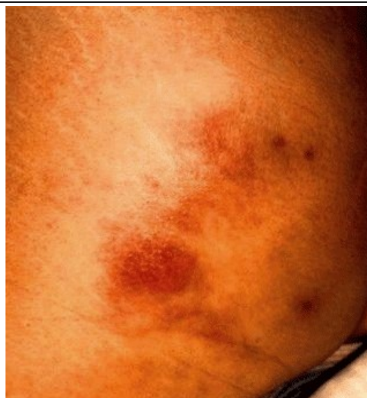
Fig 1: Edema and ecchymosis after gluteal dermal filling

There are certain transient and predictable complications which include erythema, edema and ecchymoses. They may occur immediately after the procedure or present hours after the injections are completed. In some studies, such transient adverse events related to dermal filling have been reported in as high as 21.5% 6 of the injections. Ecchymoses is usually minor and resolves without intervention after 2 to 3 days. Although ice packs and cooling after injections can increase patient comfort, they have not been found to be efficacious in reducing post-operative edema.