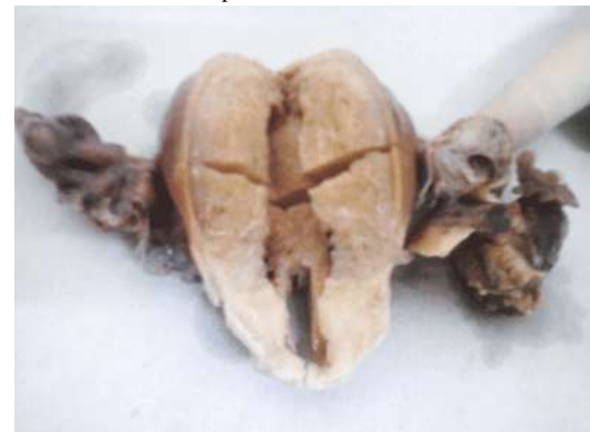
Figure 1: Gross photograph revealing cut section of the growth arising from the left fallopian tube

surrounded the lumen of the left fallopian tube and was composed of cells with "coffee-bean"-like nuclei arranged in solid nests without keratinization. Focally the tumor cells are arranged around papillae with fine fibrovascular cores (Figure2). In addition, there were areas of necrosis in the center of sheets of tumor cells. PAS and Mucicarmine stains were negative. No abnormalities were found in the right tube, ovaries, or uterus. The diagnosis of primary transitional cell carcinoma of the fallopian tube was rendered.