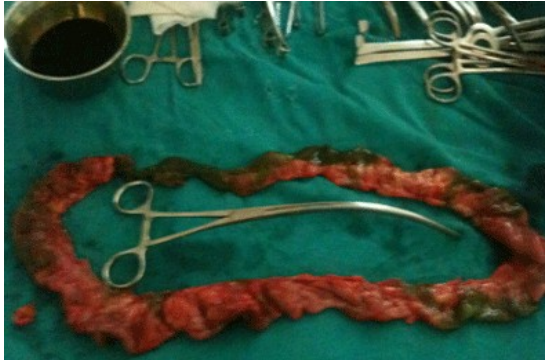
Photograph 3: Massive gut resection, about 60 cms