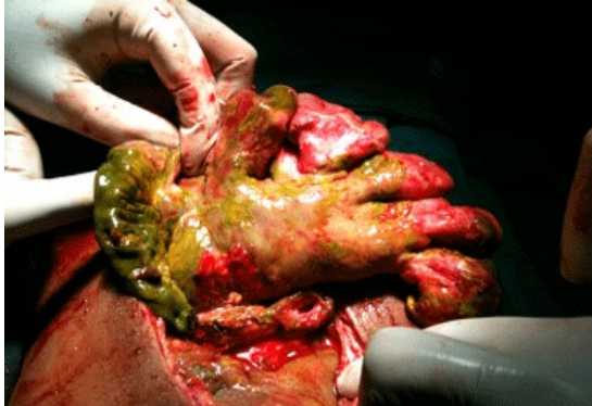
Photograph 2: Multiple perforations and gangrenous gut