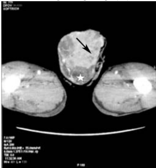
Fig 1b: Axial CECT image showing heterogeneous mass in scrotum (arrow) with posteriorly displaced testis (star).