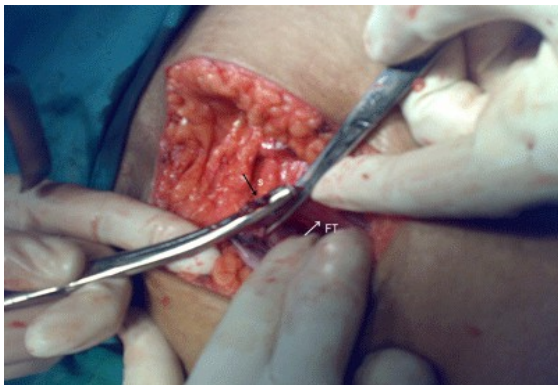
Fig-3: S-Salpingectomy, FT - normal appearing medial end of the tube

Pathology: Grossly the tube with its haemorrhagic contents, measured 9x7.5x2.5 cms. A cut section revealed an unilocular cyst containing blood tinged fluid. The inner lining of the cyst showed whitish areas of necrosis. Microscopically, the cyst