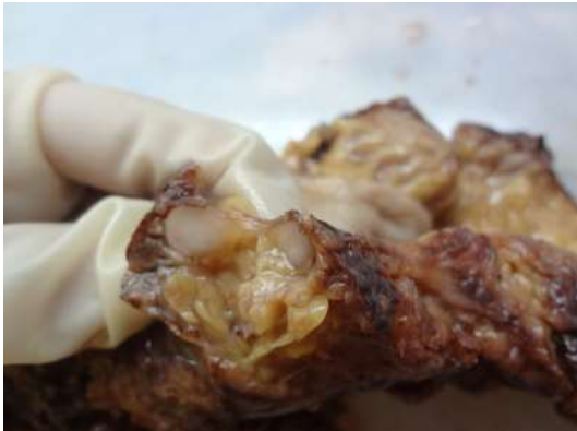
Figure 2 (a) and (b): Gross photograph of nodules in pericolic fat