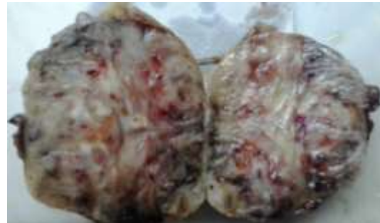
Figure 1: A well circumscribed tumour, cut section showing variegated appearance, cystic areas, hemorrhages and calcification

white to grey brown mass measuring 7x6x4 cm. Cut section revealed a grey white to grey brown variegated appearance with cystic areas, hemorrhages and areas of calcification. Microscopically it was a well circumscribed, encapsulated tumor showing hypercellular and hypocellular areas. Elongated spindle shaped neoplastic cells showed tapering nuclei with nuclear palisading. Occasional area showed enlarged, hyperchromatic nuclei with very low mitotic activity. Areas of cystic degeneration, myxoid change and ossification were noted.