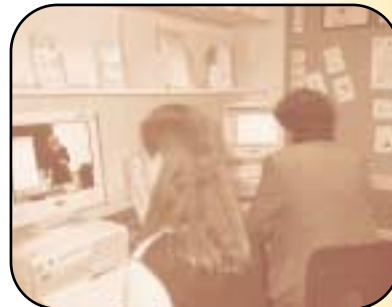
The Higher Education Resources Collection

Although individuals or small groups are welcome to visit at any time during our opening hours, group visits for up to 15 people are available by arrangement and are focused to the needs of your