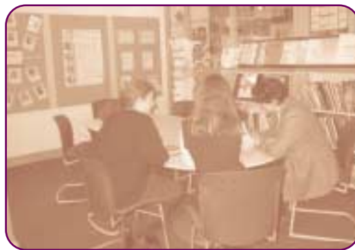
The Higher Education Resources Collection at CILT

As from the start of this academic year, the Subject Centre is fully up and running, a point marked by our London launch, hosted by CILT on 26th September. We are now beginning to provide the services that colleagues in languages, linguistics and area studies have asked for, helping to improve the quality and standard of the education we all provide.