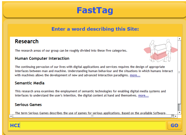
Figure 1. „FastTag“ - Tag generation screen.

Showing too many elements may confuse the user and lead to reduced interaction speed. If the number of elements that the user can select in one turn is too high, players might tend to just randomly select elements. We suggest using around ten up to twenty visible elements depending on the available game screen size and the size of each single element. The number of allowed selections should be approximately the half of this number.